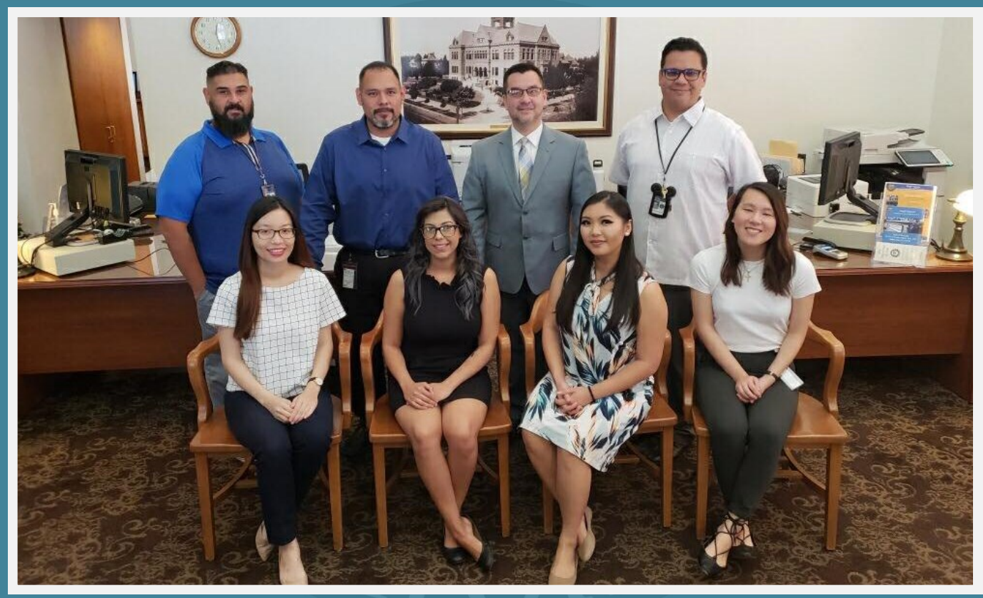
Staff at our Central office ready to serve the public during one of our special Saturday openings.