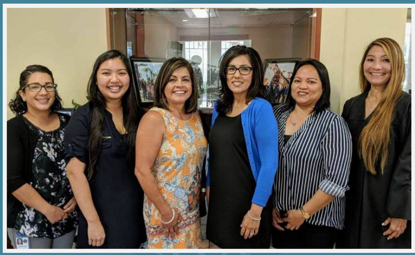
Staff at our South office ready to serve the public during our special Saturday opening.