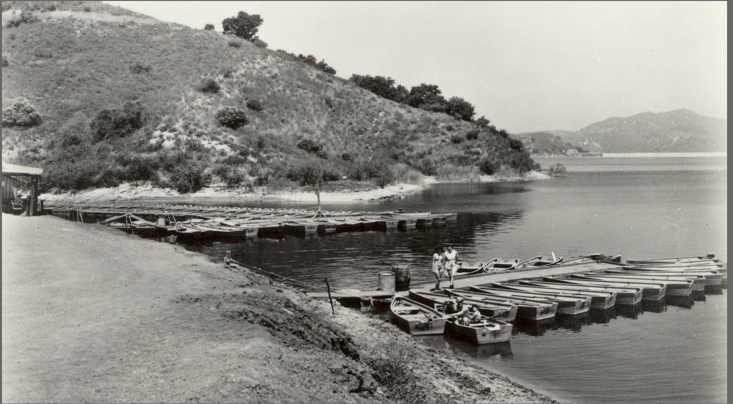
Irvine Lake in the 1940s.