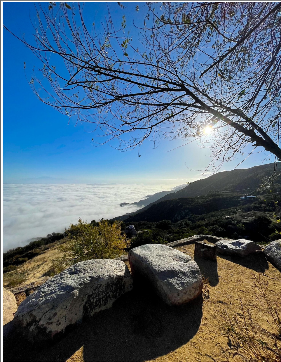
One of my staff took this photo from Ortega Highway Lookout Point showing Lake Elsinore during low cloud conditions.