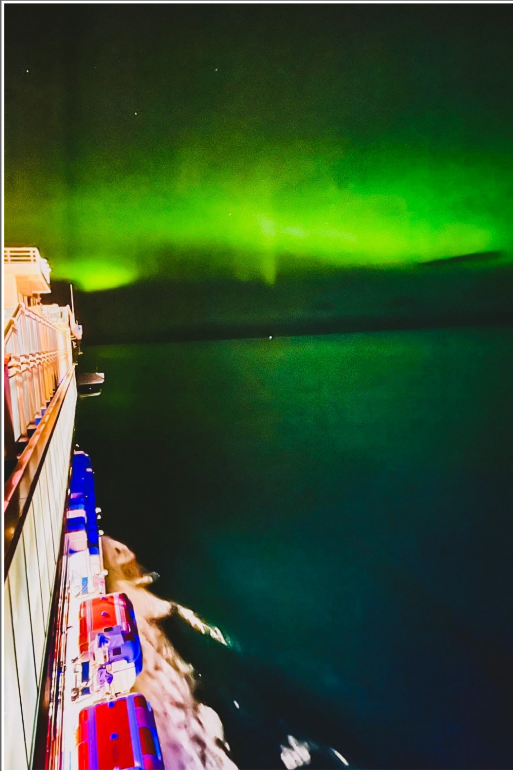
This photo of the northern lights glow was taken in Alaska while traveling on an Alaskan cruise.