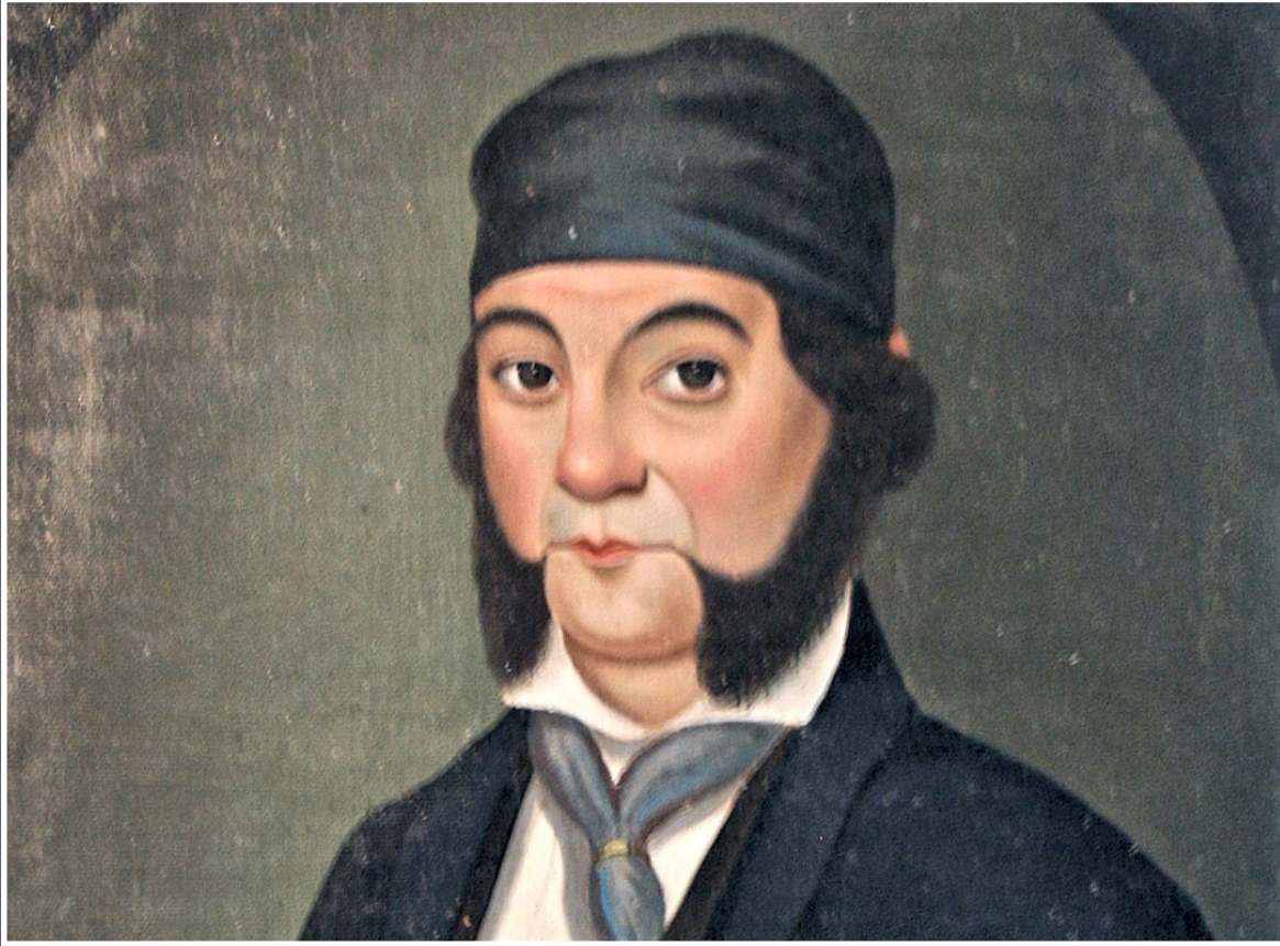
Portrait of Bernardo Yorba, circa 1850