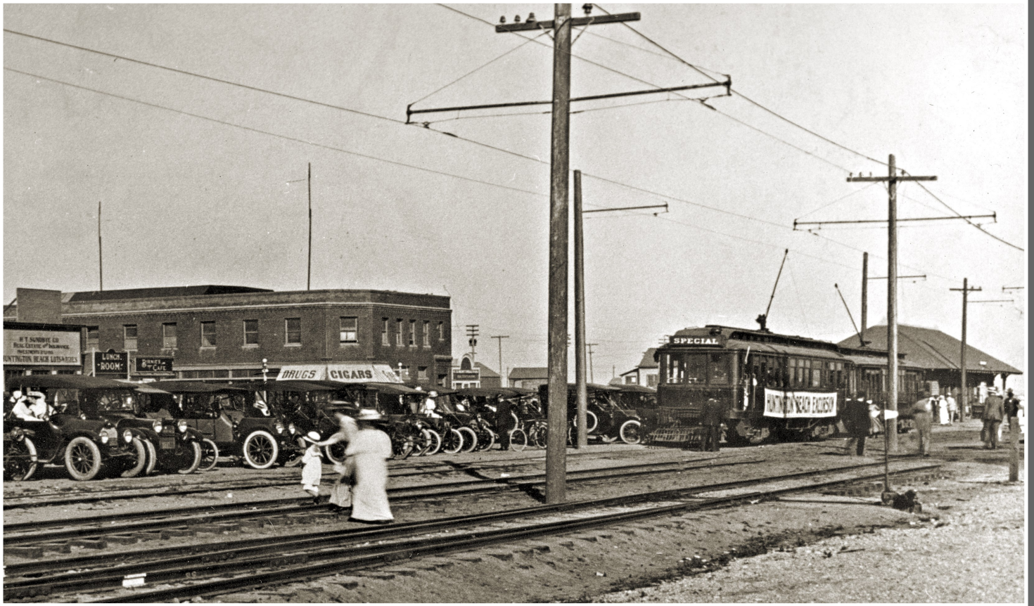
A Pacific Electric “Red Car” at Huntington Beach’s first depot, near the foot of the pier, at Main Street and Ocean Avenue (PCH), circa 1920s.