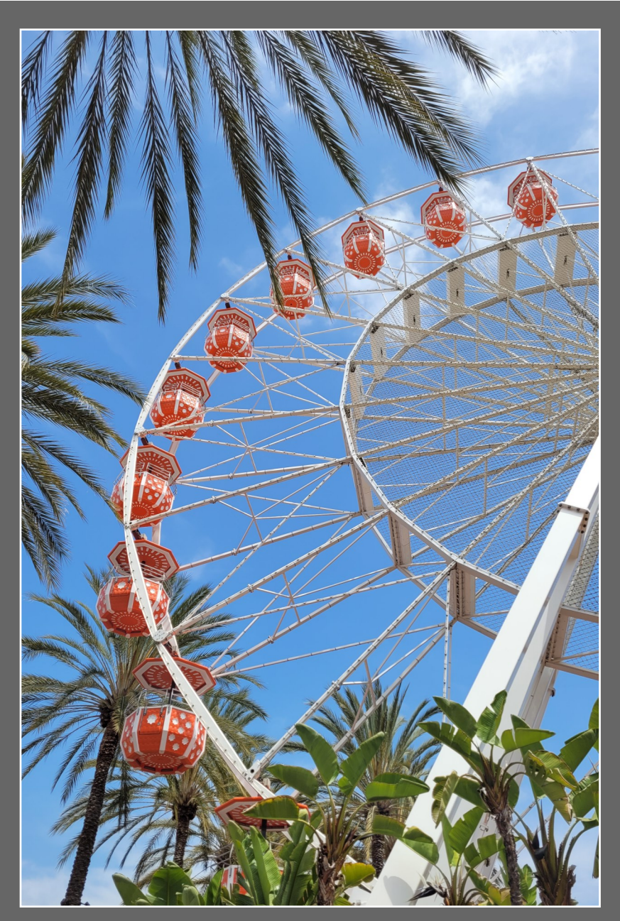
One of my staff took this photo of the Irvine Spectrum Center's 108-foot Ferris wheel in Irvine, California.