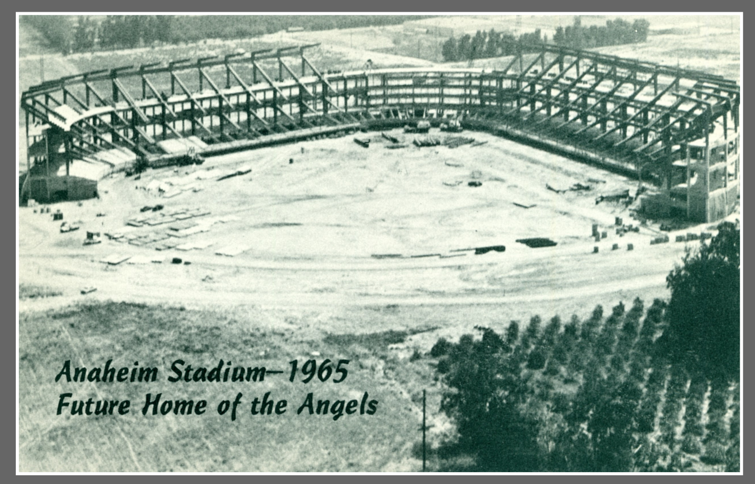
Postcard image of the construction of Anaheim Stadium, 1965. Note the orange groves in the foreground and distance.