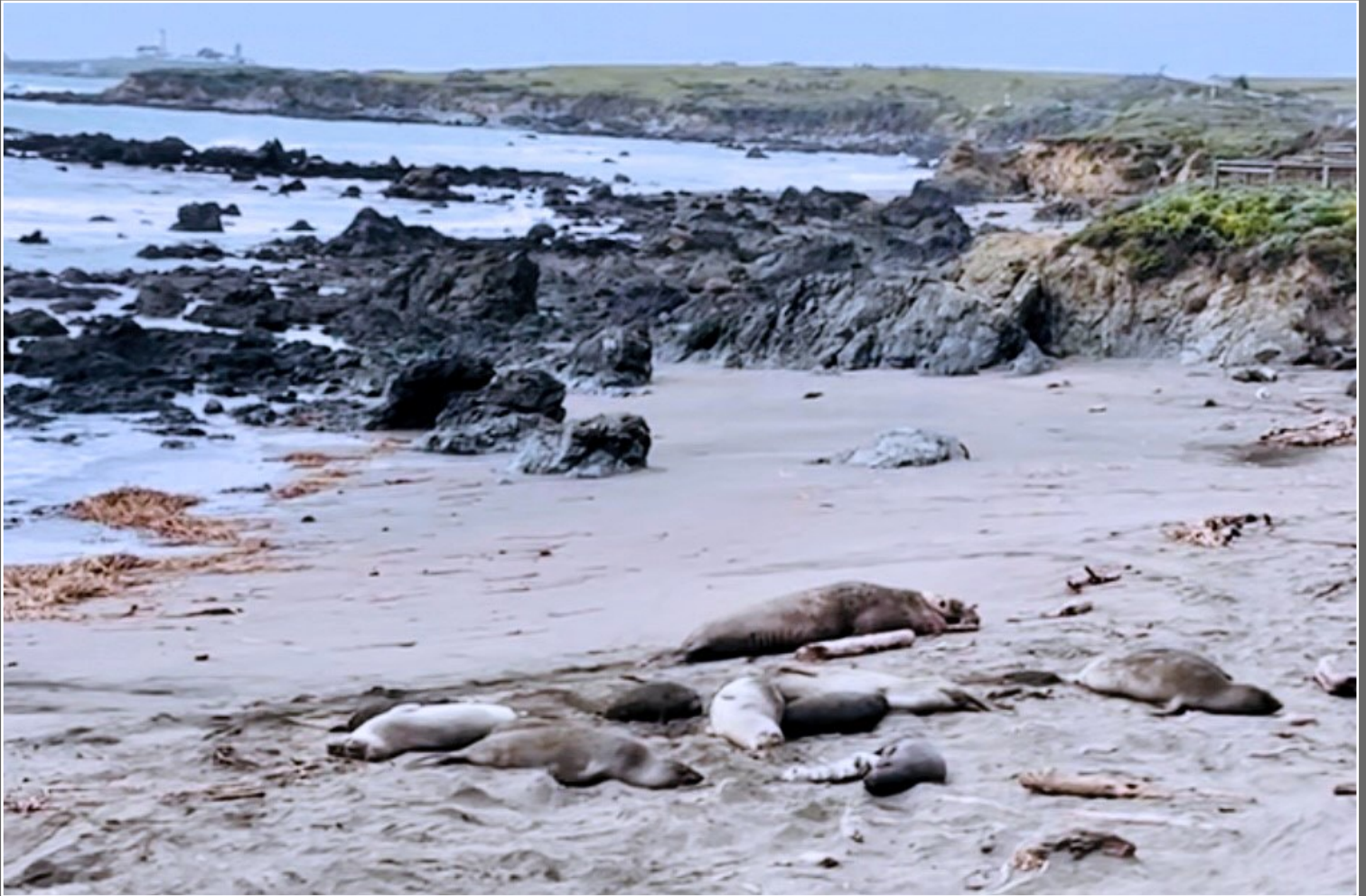
One of my staff took this photo of elephant seals at Piedras Blancas Light Station near Cambria, California.