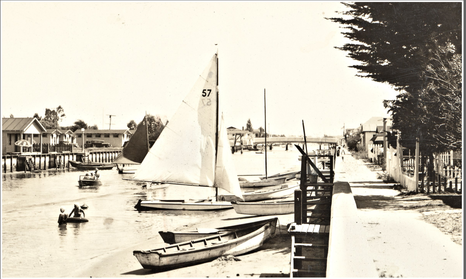
Grand Canal, Balboa Island, late 1930s.