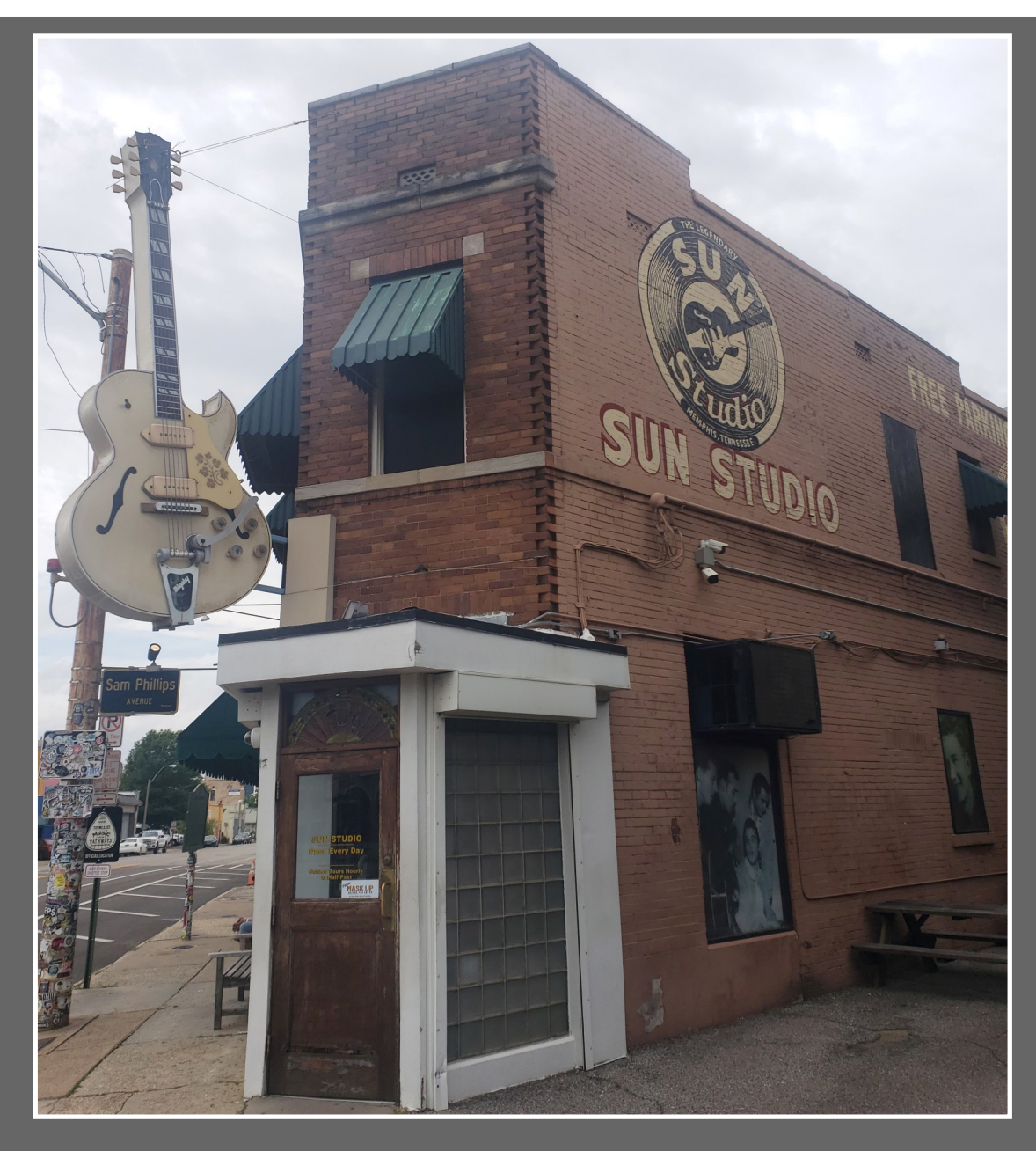
One of our staff visited the historic Sun Studio during a recent trip to Memphis, TN.