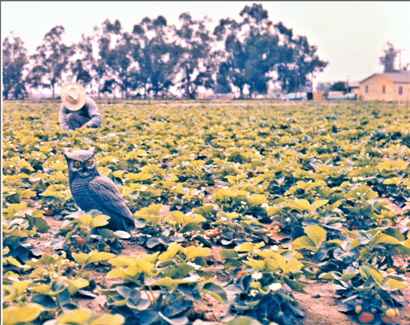
Orange County strawberry fields, 1950s.