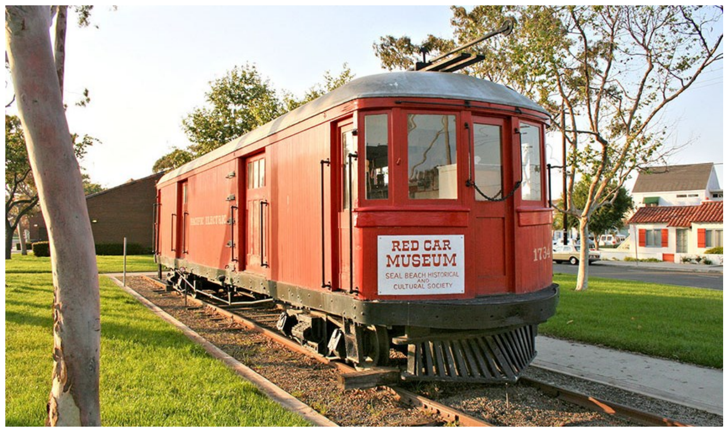
On June 17, 1904, the Pacific Electric Railway opened a "Red Car" Line from Long Beach to Huntington