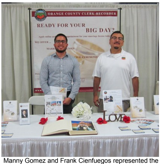
department at this year's Brides World Expo.