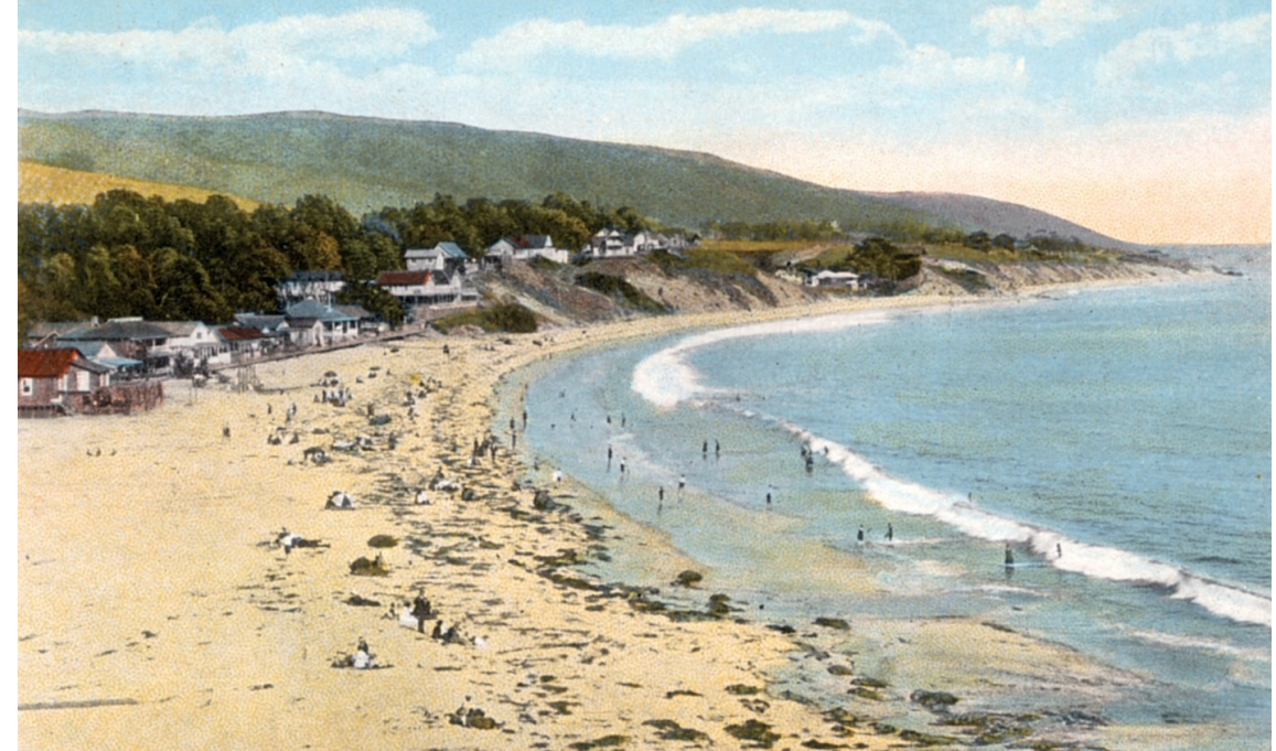
Laguna Beach became a city on June 29, 1927 – which is about when this postcard image was made. At the time, the town had a population of only 1,900.